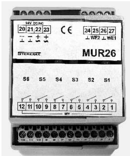
Fig.1 View of MUR26.