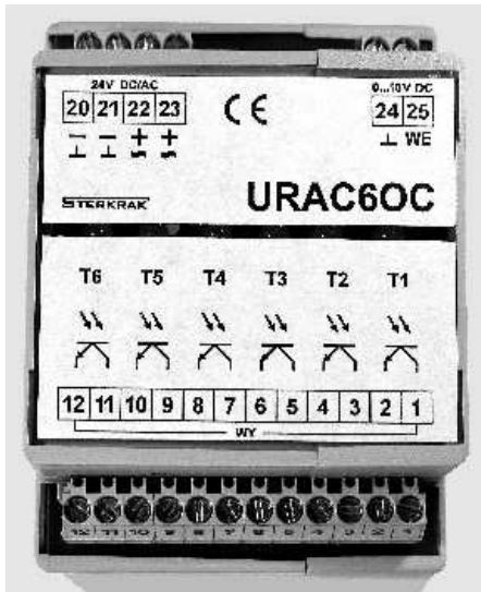
Fig.1 View of URAC60C.