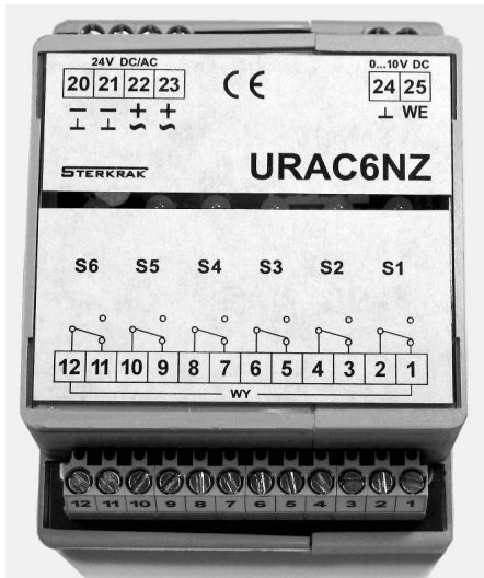
Fig.1 The URAC6NZ module.